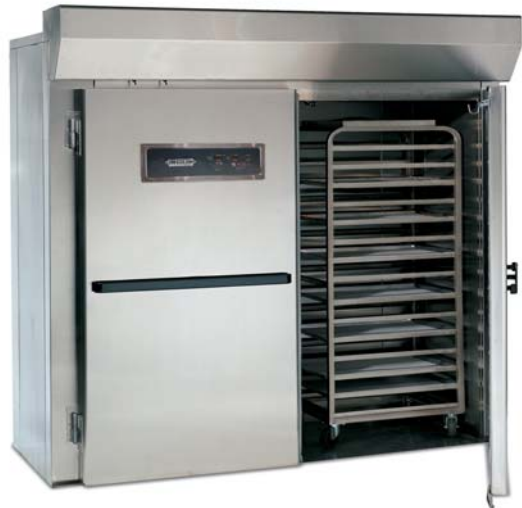
Model LRPR3-40HO Shown