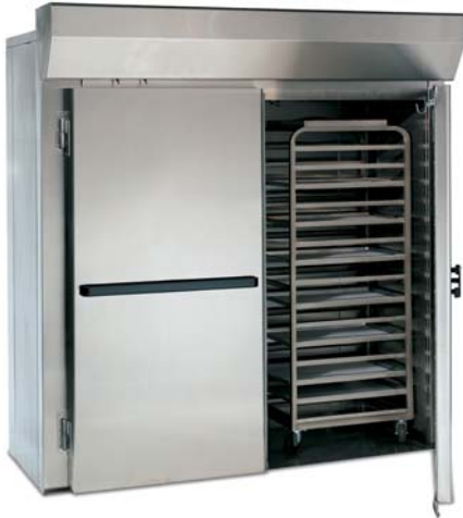
Model LRPR2-40 Shown