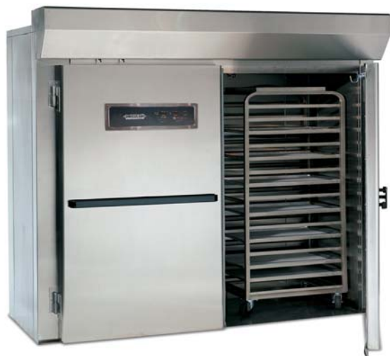
Model LRP3-40 Shown