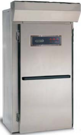
Model LRP1-40 Shown