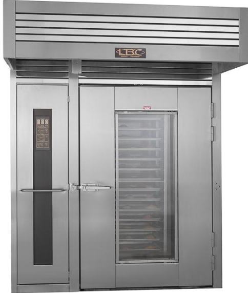
Model LRO-2E4 Shown (Rack not included)