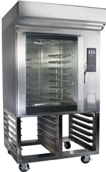
Model LMO-E8-208-S Shown